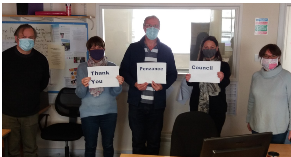
Staff and volunteers at CA's Penzance office celebrate the recent generous financial donation from Penzance Council towards their work in the town.